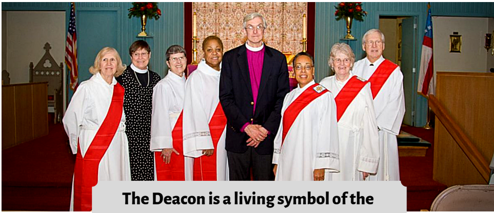
The Deacon is a living symbol of the servant ministry of the whole Church

December 2019 marked ten years of life with deacons in Delaware. On December 5, 2009, at St. Stephen's Church, six deacons were ordained in a joyous service that could not be marred even by mud and rain. That service sealed the commitment of the Episcopal Church in Delaware to the ministry of deacons, a commitment which grew from the conviction that the church ought to nurture the servant ministry of all the baptized by setting apart some particularly called to that ministry as living symbols of servant ministry.